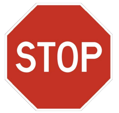
Ra-1 STOP SIGN DETAIL N.T.S.