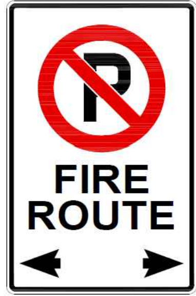
FIRE ROUTE SIGN DETAIL N.T.S.

* CALCULATION IS BASED ON: WAREHOUSE - 1 SPACE PER 200 sq.m. OF FIRST 1,000 sq.m. FLOOR AREA PLUS 1 SPACE PER 450 sq.m. OF REMAINDER OF FLOOR AREA = (1,000/200) + ((5,267.8 - 1,000)/450) TOTAL = 15 SPACES