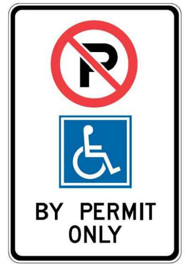
Rb-93 ACCESSIBLE SIGN DETAIL N.T.S.