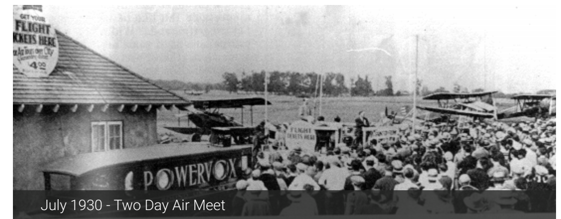
July 1930 - Two Day Air Meet