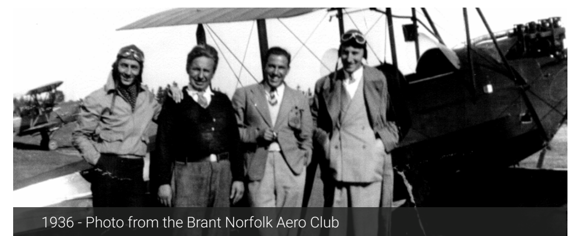
1936 - Photo from the Brant Norfolk Aero Club