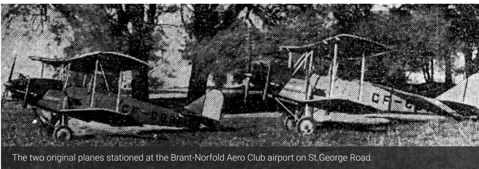
The two original planes stationed at the Brant-Norfolk Aero Club airport on St. George Road.