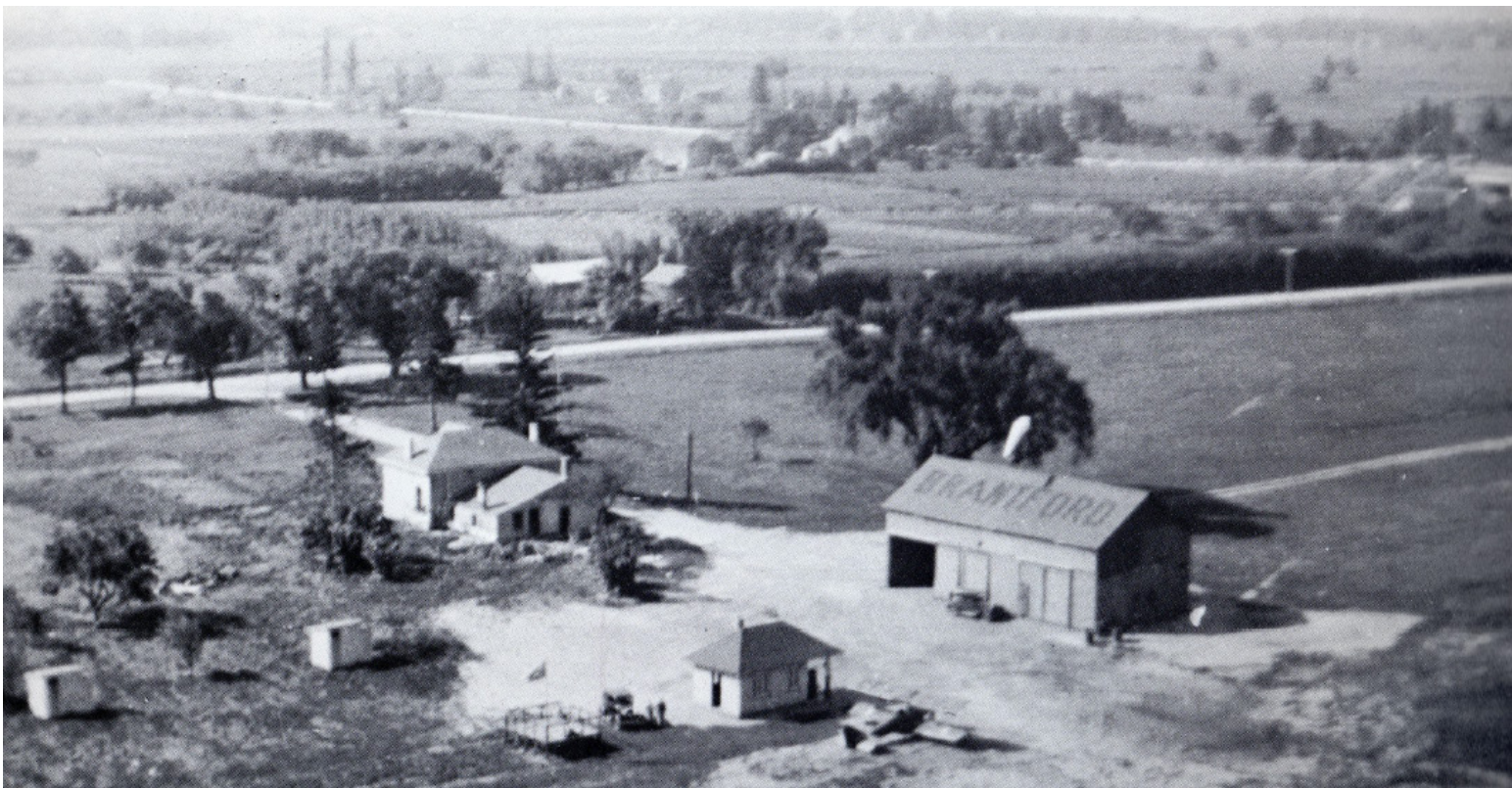
Photo shows the original airport on the St. George Road. The street immediately in front of the field is now called Fairview Drive and the road running off at an angle is King George Road. (1932)