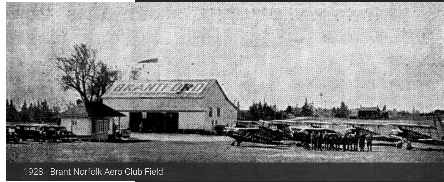
1928 - Brant Norfolk Aero Club Field